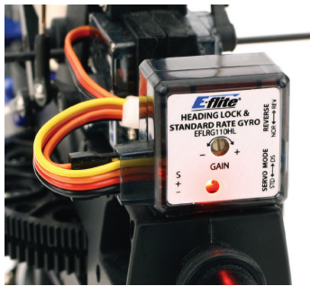
LED on solid = Ready to fly

If this fails to correct the issue, please contact the appropriate Horizon Service Center at: