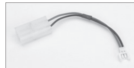
DYN5003 Charge Adapter Tamiya Female: Losi Micro