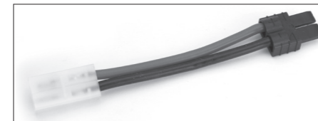
DYN5015 Charge Adapter: Tamiya Female to Traxxas Male