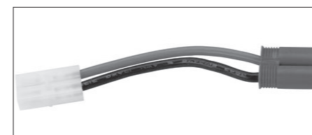
DYN5002 Charge Adapter Tamiya Female: EC5™ Female