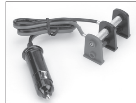
DYN5010 12V DC Power Adapter with Cig Plug