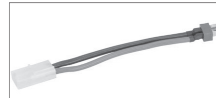
DYN5000 Charge Adapter Tamiya Female: Deans Male