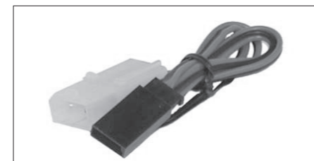
DYN4003 Receiver Pack Charger Adapter

The Propht Sport II includes the Tamiya style charge cord (DYN5005). Dynamite offers charge cords and adapters for all your battery charging requirements. See the list below to order additional connectors.