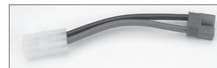
DYN5001 Charge Adapter Tamiya Female: EC3™ Female